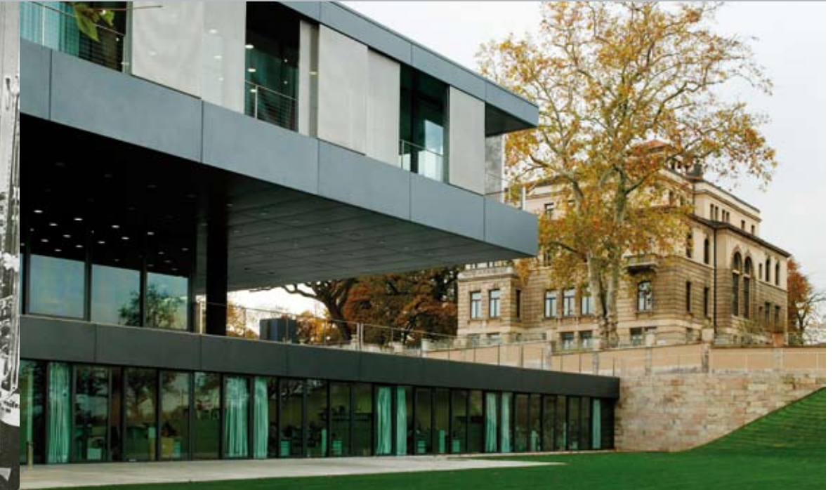
↑ Headquarters of the Robert Bosch Foundation with new building and Villa Bosch

“It is my intention, apart from the alleviation of all kinds of hardship, to promote the moral, physical and intellectual development of the people.” This was Robert Bosch’s message in 1935 to the company he had founded in the course of drawing up his will.