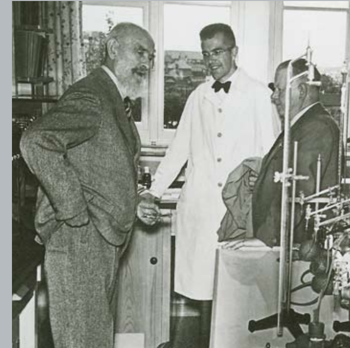
↑ The Robert Bosch Hospital opened in Stuttgart on 10 April 1940