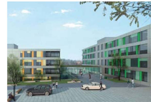
↑ New building of the Mental Healthcare Centre in Bad Cannstatt →