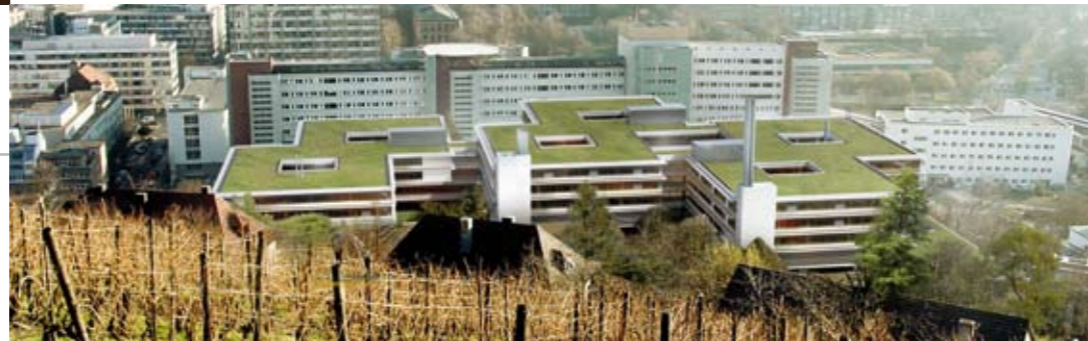
↑ New Olga Hospital building/women's clinic – view from Killesberg